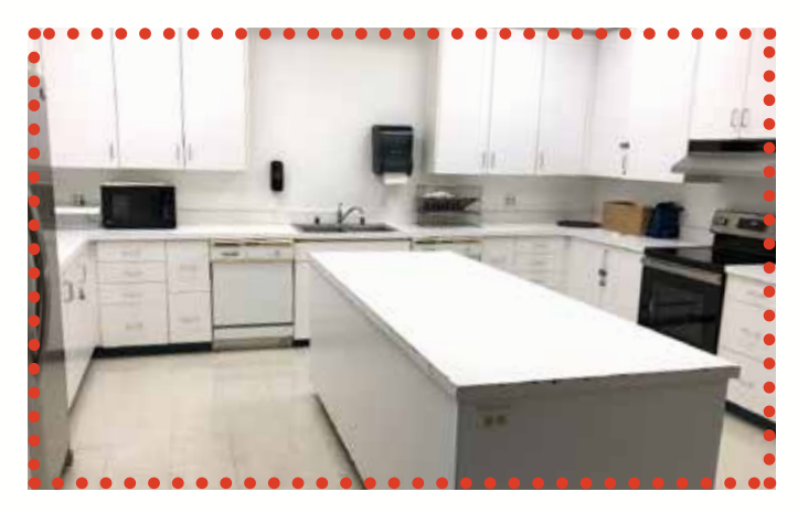
Kitchen at Palm Desert